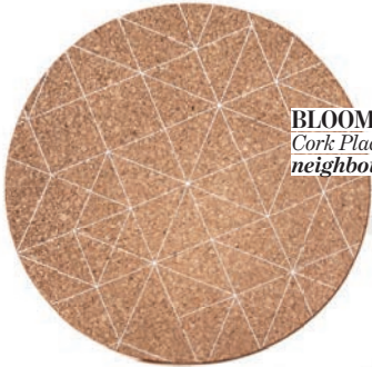
BLOOMINGVILLE Cork Placemat; £12.50, neighbourhoodstore.com