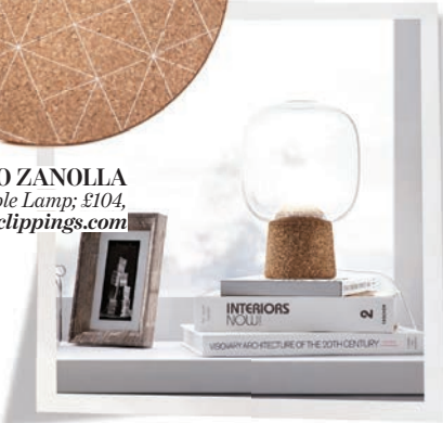
ENRICO ZANOLLA Pica Table Lamp; £104, clippings.com