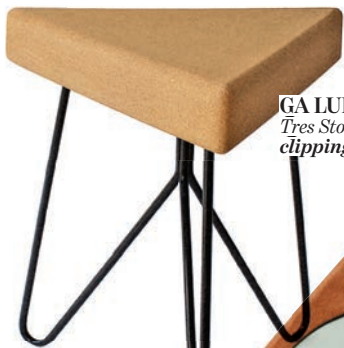
GA LULA Tres Stool; £87; clippings.com