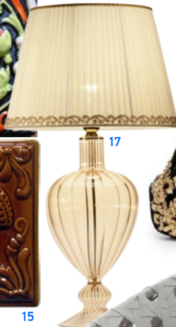
15. Collections from Russian Tiles. 16. Porcelain Domes lights, des. Enrico Zanolla. 17. Patrizia table lamp. 18. Bag from Dolce&Gabbana collection. 19. Garza home textile, linen. 20. Chair, des. Patricia Urquiola

designs: images from fairy and folk tales, magical creatures and birds. Russian crafts have always possessed their own unique artistic characteristics and been imbued with a dash of national colour. They represent one of the ways of expressing the aesthetic idea and traditional belief of old Rus that beauty was a divine blessing, and that earthly beauty as demonstrated in the decoration of church and home was a reflection of heavenly beauty, truth and holiness.